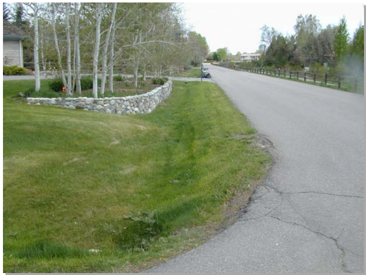
Photograph GS-1. This grass swale provides treatment of roadway runoff in a residential area.

Grass swales are densely vegetated trapezoidal or triangular channels with low-pitched side slopes designed to convey runoff slowly. Grass swales have low longitudinal slopes and broad cross-sections that convey flow in a slow and shallow manner, thereby facilitating sedimentation and filtering (straining) while limiting erosion. Berms or check dams may be incorporated into grass swales to reduce velocities and encourage settling and infiltration. When using berms, an underdrain system should be provided. Grass swales are an integral part of the Low Impact Development (LID) concept and may be used as an alternative to a curb and gutter system.