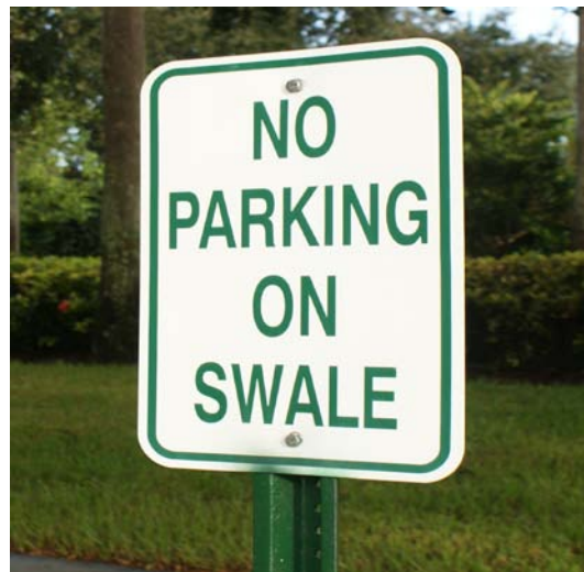
Photograph GS-2. This community used signage to mitigate compaction of soils post-construction.